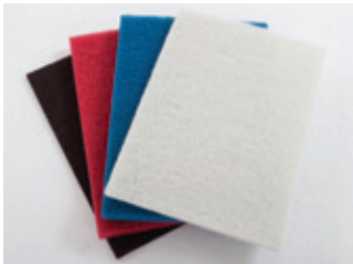
Various Scrub Pads