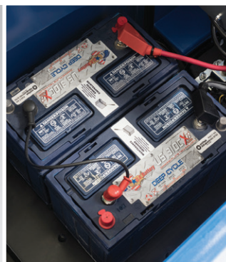
Battery Compartment The SA40™ is available with wet or AGM maintenance-free batteries.