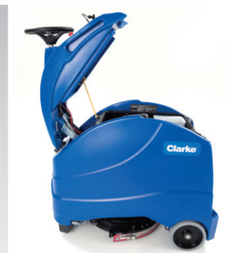
Clam Shell Design The clam shell design makes charging easy with virtually no increase in the machine's foot print. This allows it to easily fit into a cramped janitor's closet.