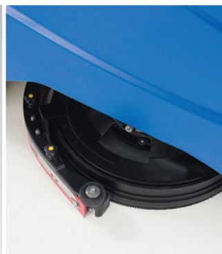
Scrub Deck The scrub deck features a rugged industrial 3-lug attachment system for maximum durability and low total cost of ownership.