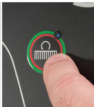
Scrubbing One-Touch™ scrubbing.